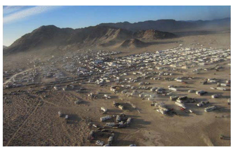
there must be 10,000 RVs and 50,000 people at KoH. This event is huge. If you want to be entertained do an internet on King Of The Hammers there are no shortage of pictures, videos and stories about this event.

that hangs over the whole valley. The dust cloud does not make it Brad's Place.