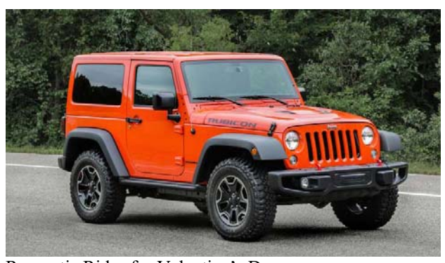
Romantic Rides for Valentine's Day